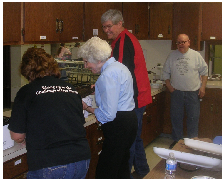
Immanuel Junction City LLL Group served 3 choices of soups, relishes, and various desserts to raise funds for the district project.