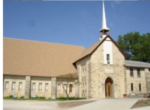
Left area map light grey box Camp Webster (exit Ohio St. North); Top Climbing wall, fly with the greatest of ease; center lake; 2nd to bottom Gym & meeting rms; bottom Chapel.

No meals Friday evening, Saturday breakfast, lunch, dinner, Sunday breakfast, lunch.