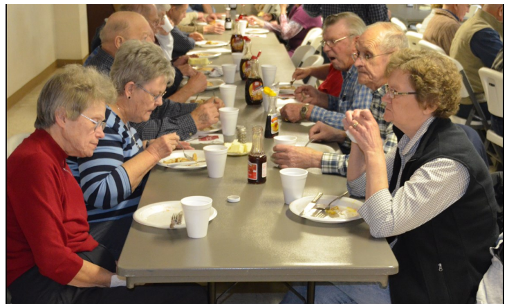
Zion-Linn Zone 7 Pancake Feed January 13