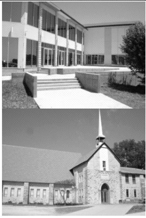
Left area map light grey box Camp Webster (exit Ohio St. North); Top Climbing wall, fly with the greatest of ease; center lake; 2nd to bottom Gym & meeting rooms; bottom Chapel.

No meals Friday evening, Saturday breakfast, lunch, dinner, Sunday breakfast, lunch.