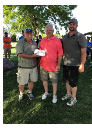
Golf Tournament Top Four Teams2nd Place3rd PlaceWinchesterNortonville #1