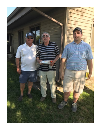
4th Place St. Luke #3 Manhattan